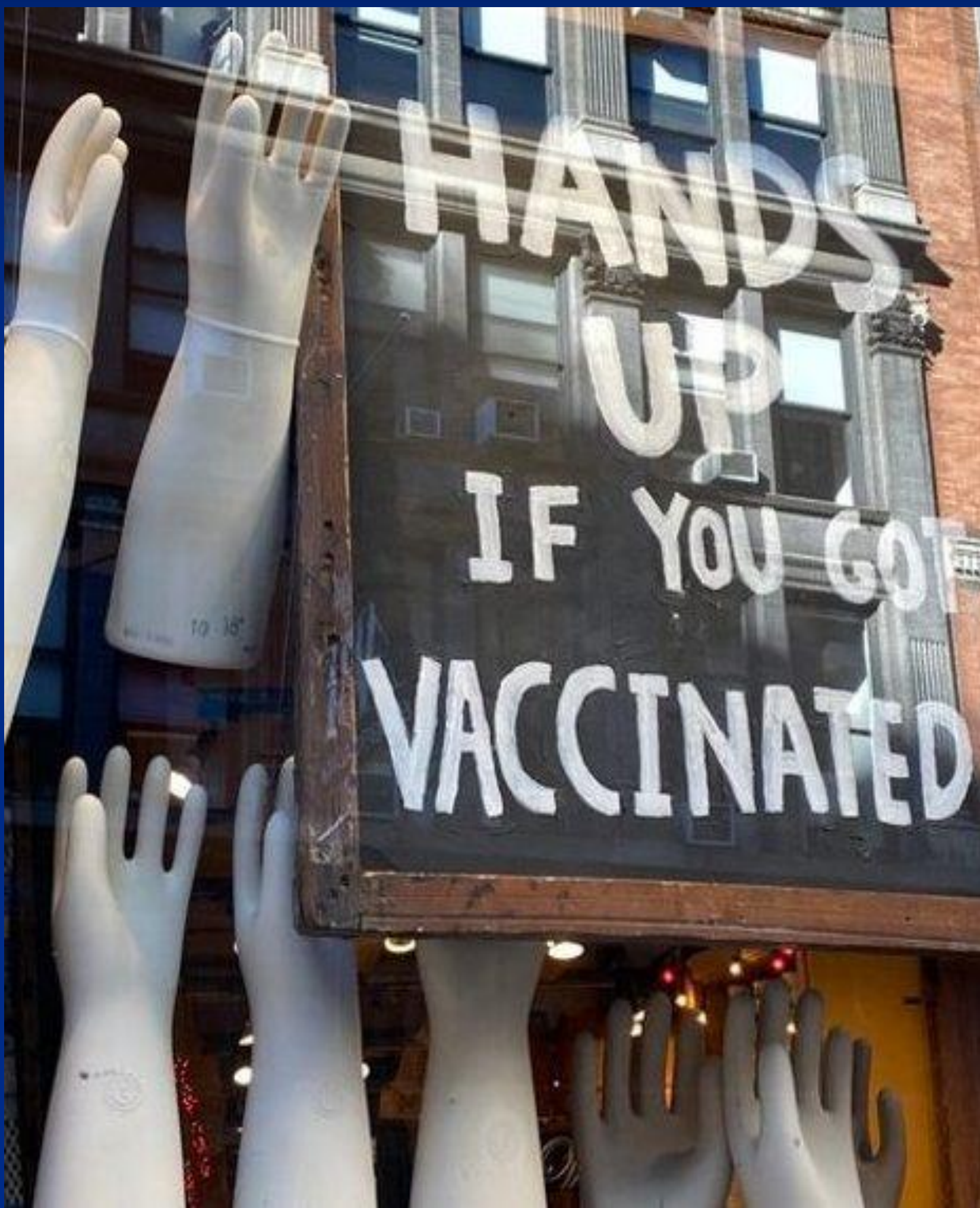
A playful window display submitted to PJP promotes vaccination with humor.