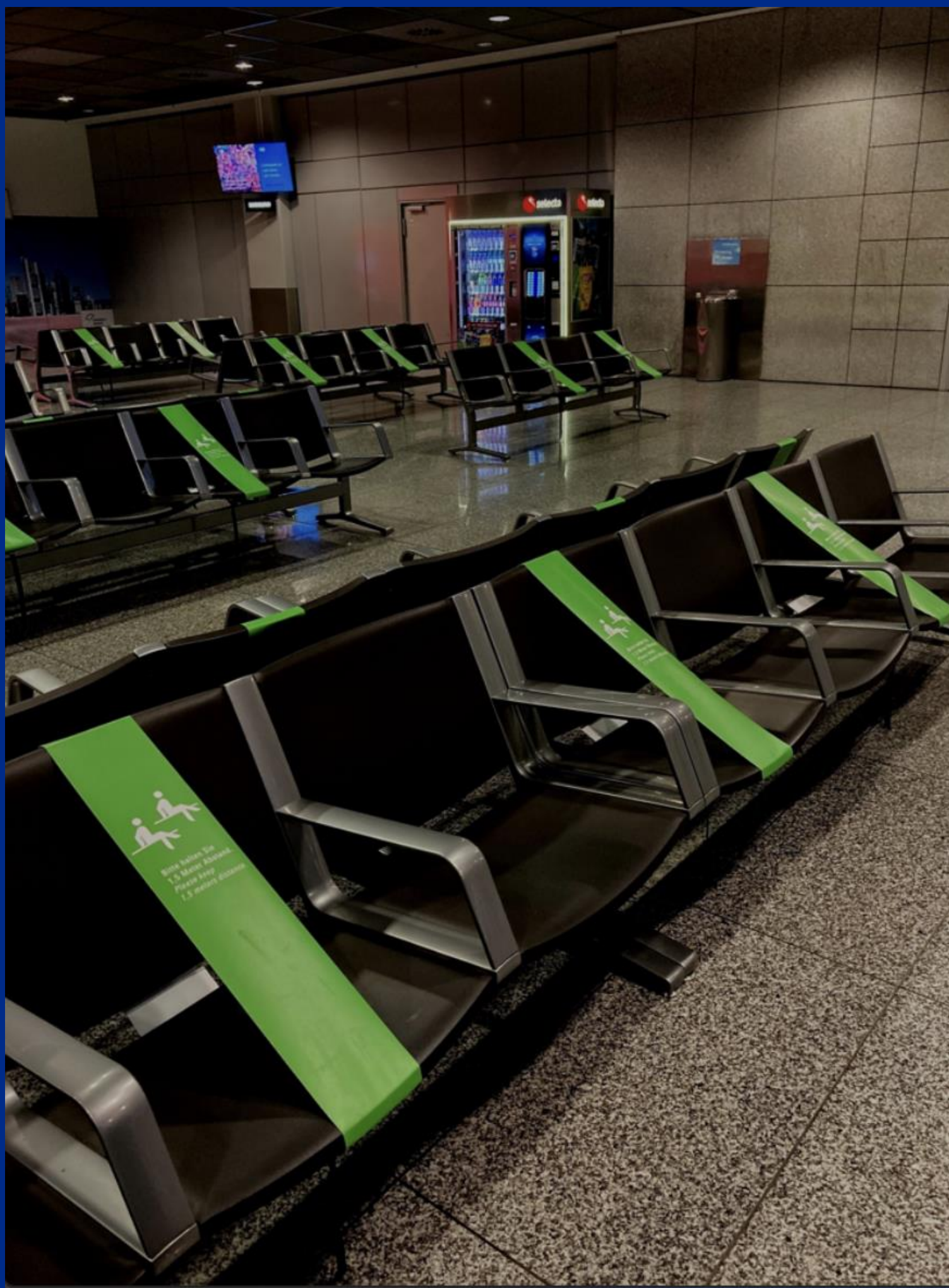
This PJP photo captures the isolation of travel during COVID-19.