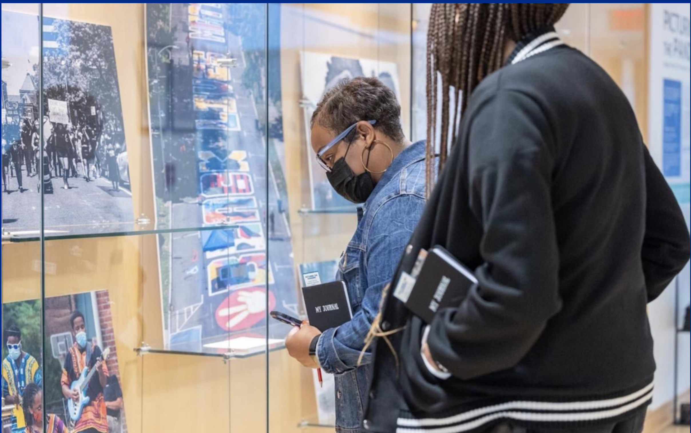
Visitors at Hartford Public Library in 2022